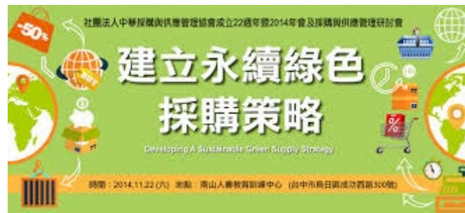
The concept of Green procurement of NCUT