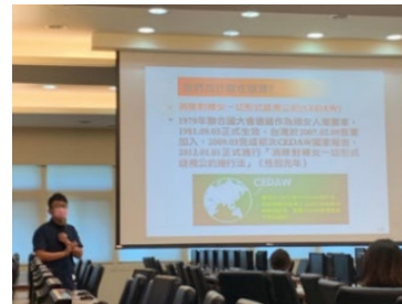
Second Shift: Balancing Family, Marriage, and Work Division of Labor