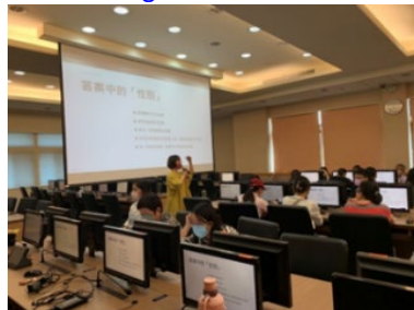
Special Speech on Gender Mainstreaming