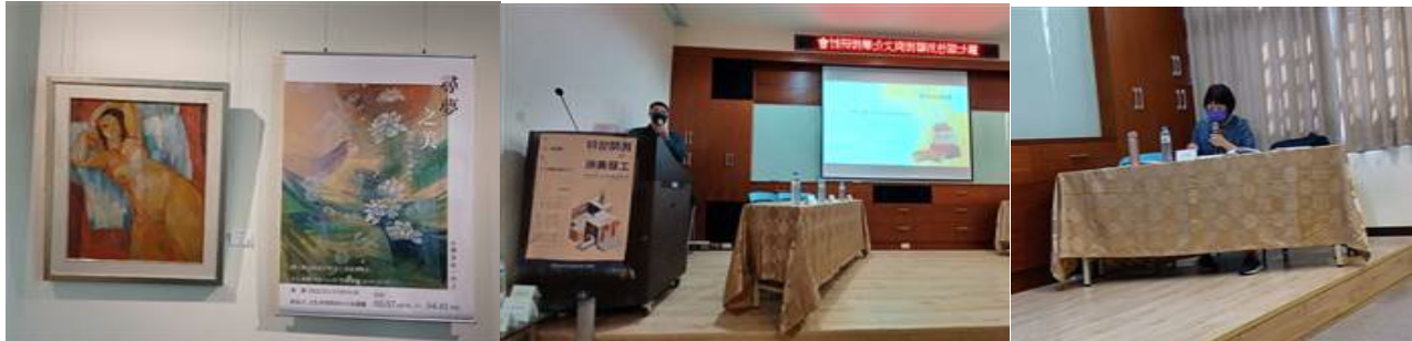
Photos of the 7th Gender Art and Culture Academic Symposium