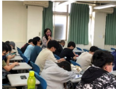
Discussing the Psychology of Adult Love and Relationship Cultivation Through Korean Dramas