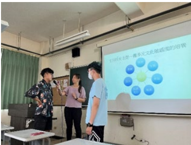
Unlocking Gender Awareness ~ Opening New Horizons About Gender