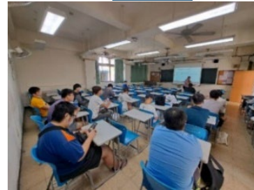
Bringing Us Closer to Love ~ Unlocking Gender Violence