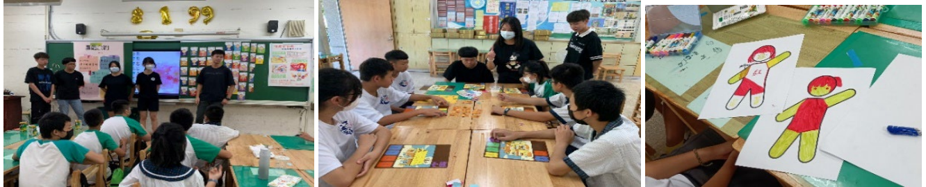
Now with NCUT~ Make-Believe Game and Emotional Family Game

are guided to understand and be aware of emotions actively. They learn to explore issues related to gender equality, analyze potential conflicts within families using diversified thinking, and cultivate positive interactive attitudes to establish effective communication. This is illustrated in the following Figure.