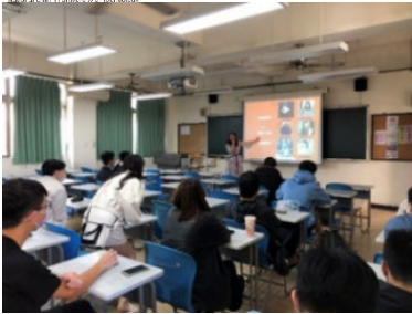
Discussing the Psychology of Adult Love and Relationship Cultivation Through Korean Dramas