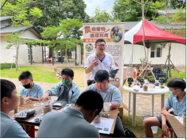
NCUT jointly organized a food and agriculture education package tour in Shinshe, Taichung City, attracting 300 New Taipei primary school students to experience it