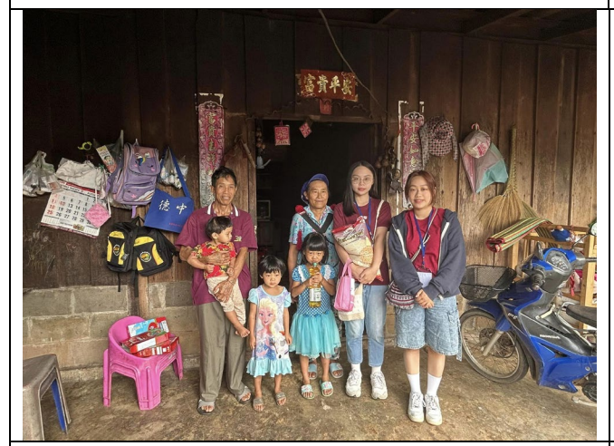
NCUT overseas volunteer team went to Chiang Rai to help educate local children

Cultivate green-collar talents through practical methods NCUT team of teachers and students assists the sustainable transformation of the industry