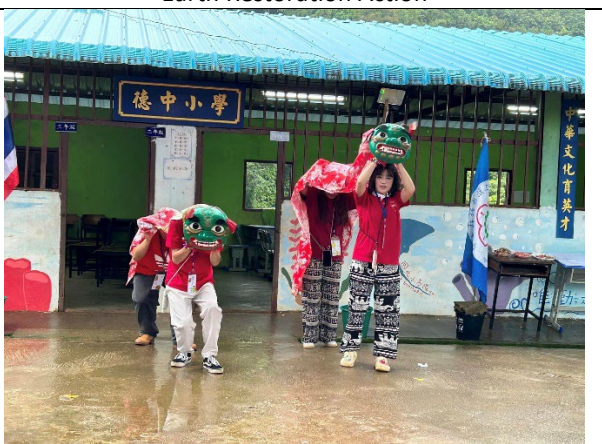
NCUT overseas volunteer team went to Chiang Rai to help educate local children