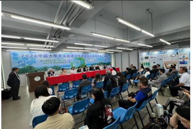
NCUT participates in promoting climate change education and building a green and sustainable campus