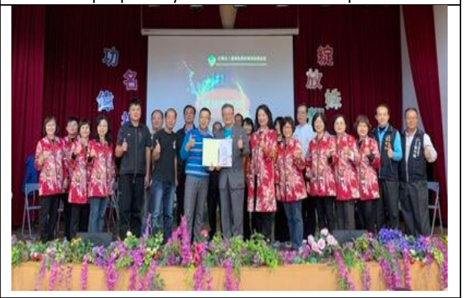
NCUT and Taiwan Energy and Environmental Development Association organize Arbor Day "Earth Restoration Action"