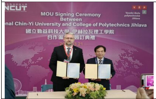
NCUT signed a memorandum of understanding with Czech Jihlava Institute of Technology to cultivate international talents