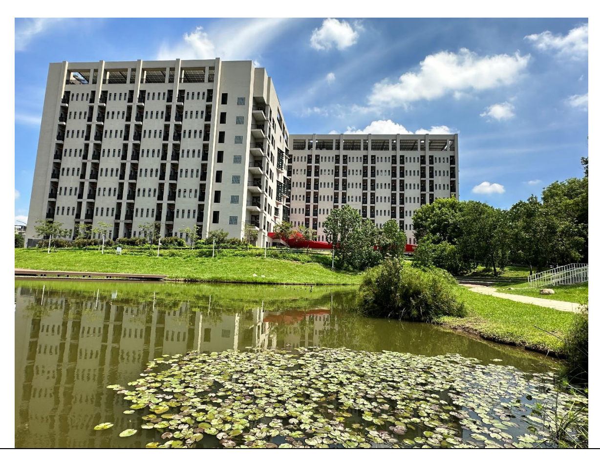
The Mingxiu Lake of NCUT can be used as an ecological lake at the campus, and it also has a function of detention ponds, which can regulate the amount of water.