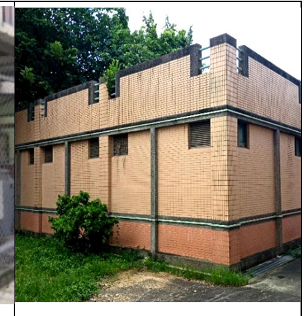
Guoxiu Teaching Building Rainwater Recovery System, NCUT