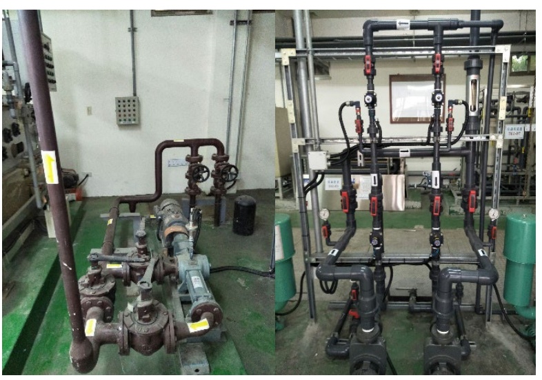
Sewage plant treatment equipment