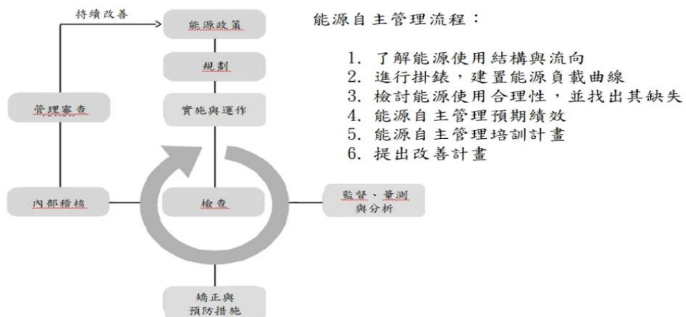
The core work of energy self-management